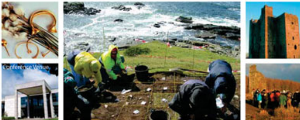
Sixth World Archaeological Congress